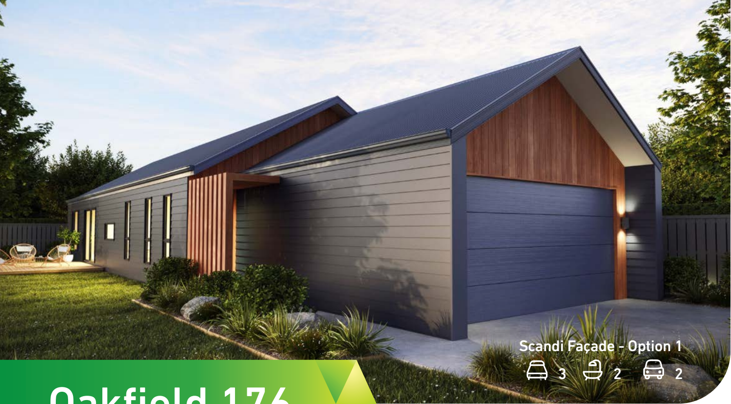
Scandi Façade - Option 1