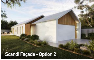
Scandi Façade - Option 2