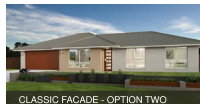
CLASSIC FACADE - OPTION TWO