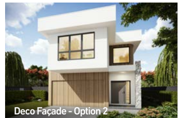
Deco Façade - Option 2