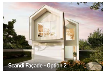
Scandi Façade - Option 2