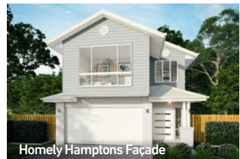
Homely Hamptons Façade