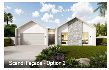
Scandi Façade - Option 2