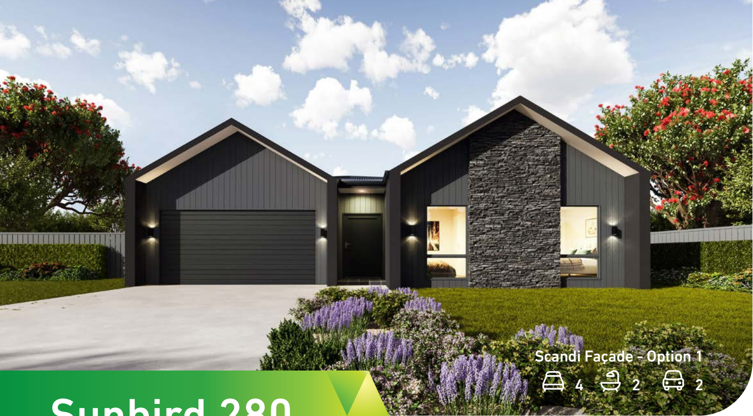
Scandi Façade - Option 1