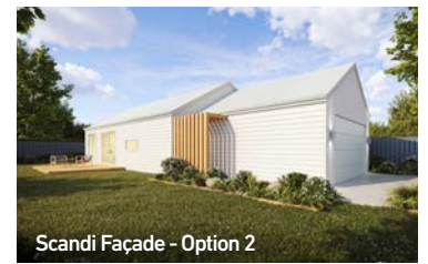
Scandi Façade - Option 2

Floor plan and dimensions shown are for the Classic Façade.