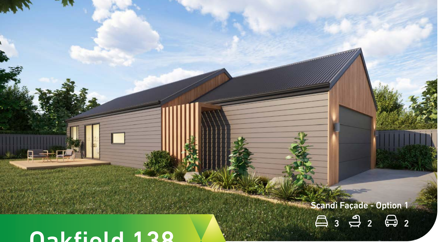
Scandi Façade - Option 1