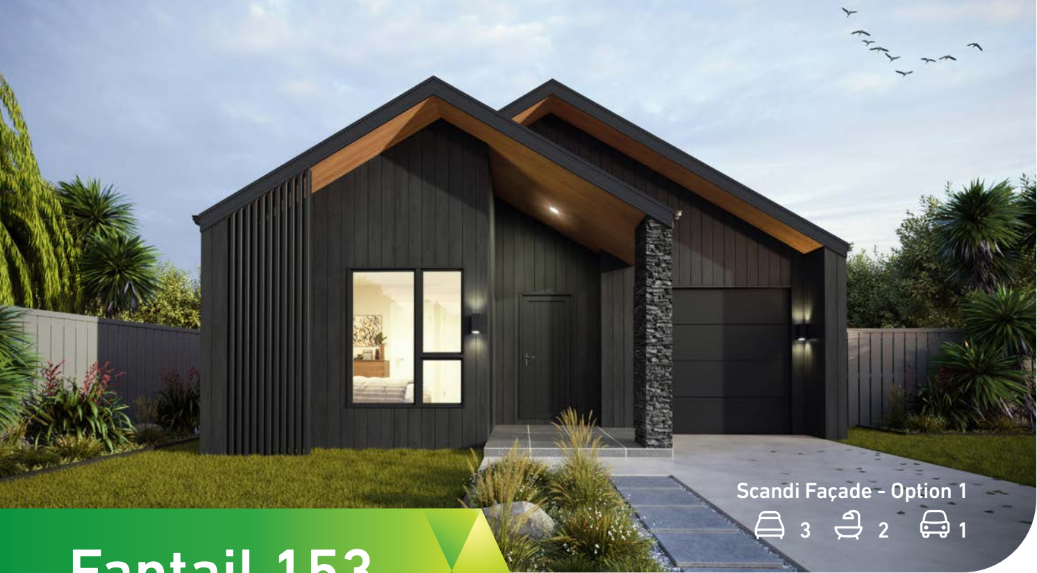
Scandi Façade - Option 1