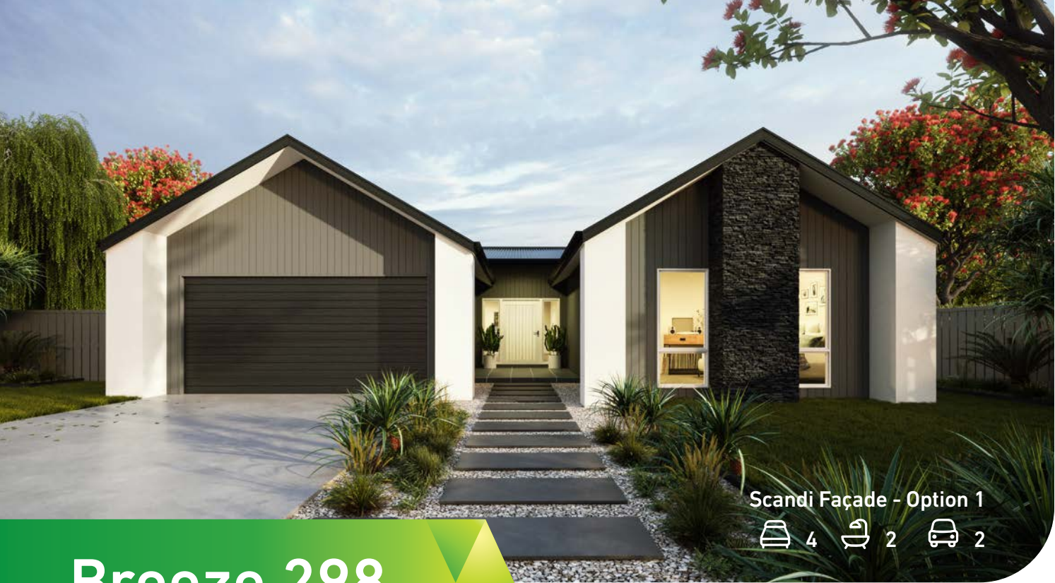
Scandi Façade - Option 1