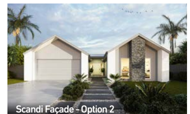
Scandi Façade - Option 2