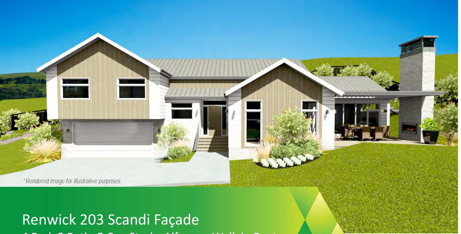
* Rendered image for illustrative purposes